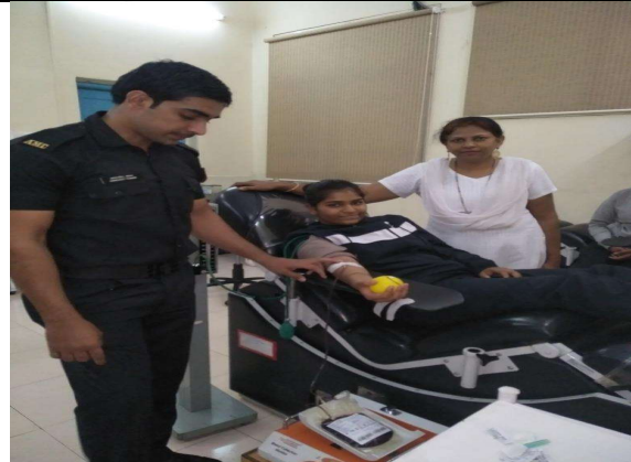
BLOOD DONATIONCAMP AT COMMAND HOSPITAL