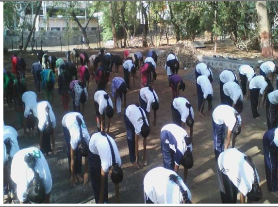
INTERNATIONAL YOGA DAY