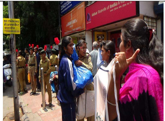
COTTON BAG DISTRIBUTION