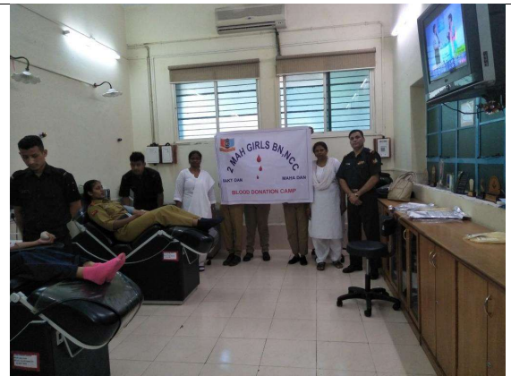
BLOOD DONATIONCAMP AT COMMAND HOSPITAL