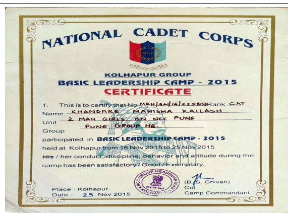
BASIC LEADERSHIP CAMP, KOLAHPUR

Motto of NCC Unity and Discipline एकता और अनुशासन