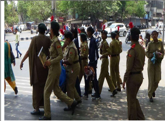
COTTON BAG DISTRIBUTION