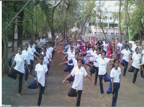
INTERNATIONAL YOGA DAY