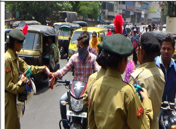
COTTON BAG DISTRIBUTION