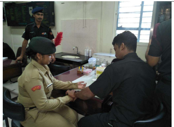
BLOOD DONATIONCAMP AT COMMAND HOSPITAL

Motto of NCC Unity and Discipline एकता और अनुशासन