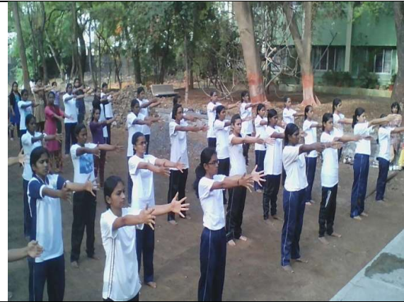
INTERNATIONAL YOGA DAY