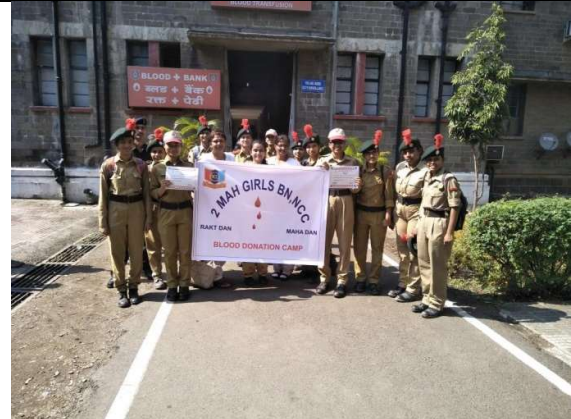
BLOOD DONATIONCAMP AT COMMAND HOSPITAL