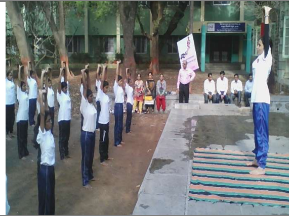
INTERNATIONAL YOGA DAY