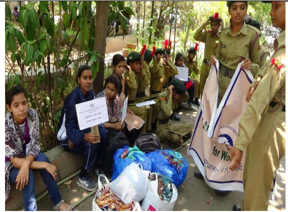
COTTON BAG DISTRIBUTION